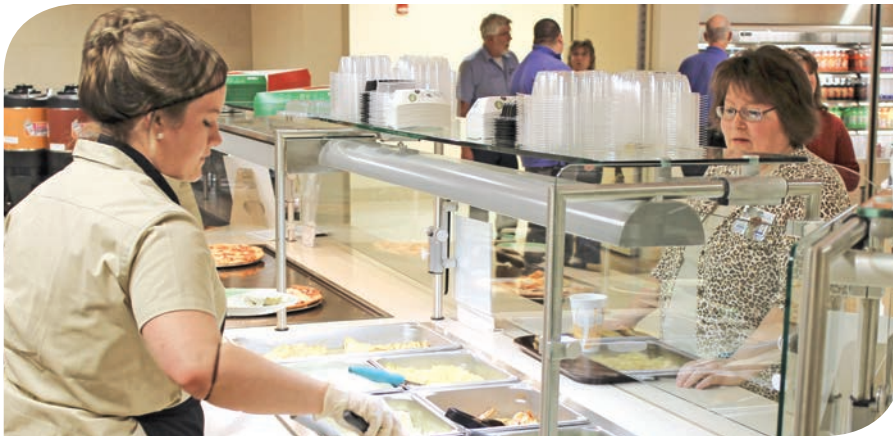
THE WEGMAN FAMILY NUTRITIONAL SERVICES CENTER