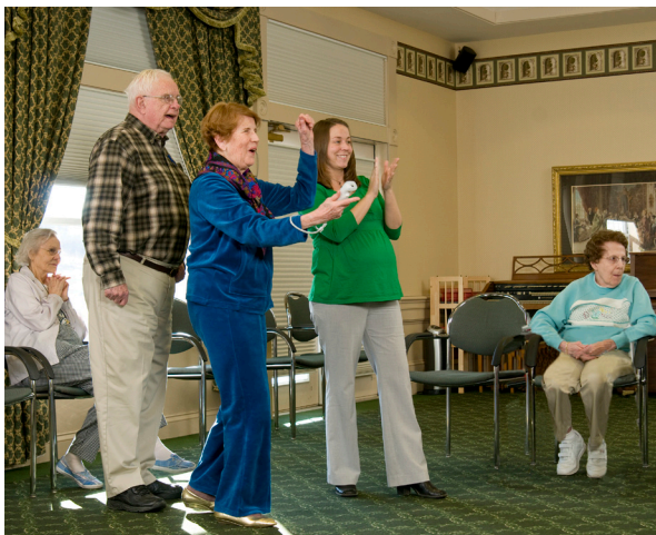
Residents of Clark Meadows, the enriched living community adjacent to Ferris Hills, enjoy trying their hands at Wii™.