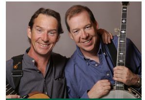
An ice cream social will precede the first Sunset Serenades concert, set for July 8 featuring the Dady Brothers.

NONPROFIT ORG. US POSTAGE PAID PERMIT NO. 300 ROCHESTER, NY