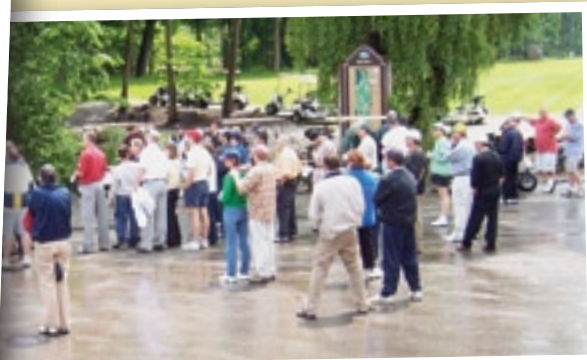
Heavy rains didn't stop golfers from playing in the 2nd Annual Margery Coughlin Pawluk Golf Tournament. The event was held at Reservoir Creek Golf Course in Naples on June 9, 2006 and raised over $8,000 for the MCP Patient Needs Fund at the Sands Cancer Center.