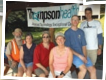
Cyclists had their choice of a 15-mile, 30-mile or 62.5-mile ride in 95-degree humid weather at the 4th Annual Ride for Independence on July 29, 2006. Nearly $1,000 was raised for Thompson Health's Rehabilitation Aftercare Program.