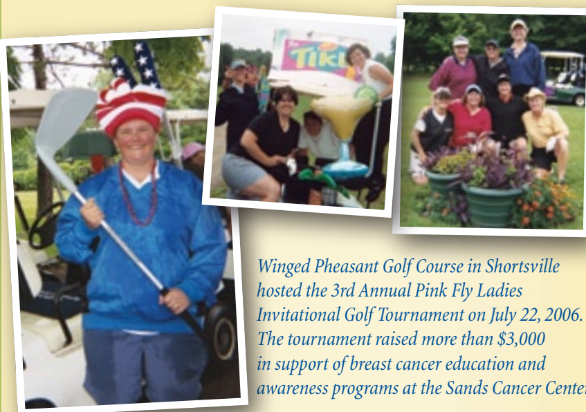
Winged Pheasant Golf Course in Shortsville hosted the 3rd Annual Pink Fly Ladies Invitational Golf Tournament on July 22, 2006. The tournament raised more than $3,000 in support of breast cancer education and awareness programs at the Sands Cancer Center.