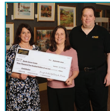
Finger Lakes Gallery & Frame Silent Art Auction