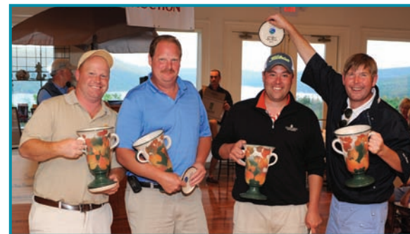
12th Annual Sands Cancer Center Golf Classic