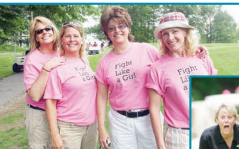
7th Annual Pink Fly Golf Tournament