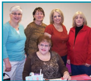
3rd Annual Croppin' for a Cure