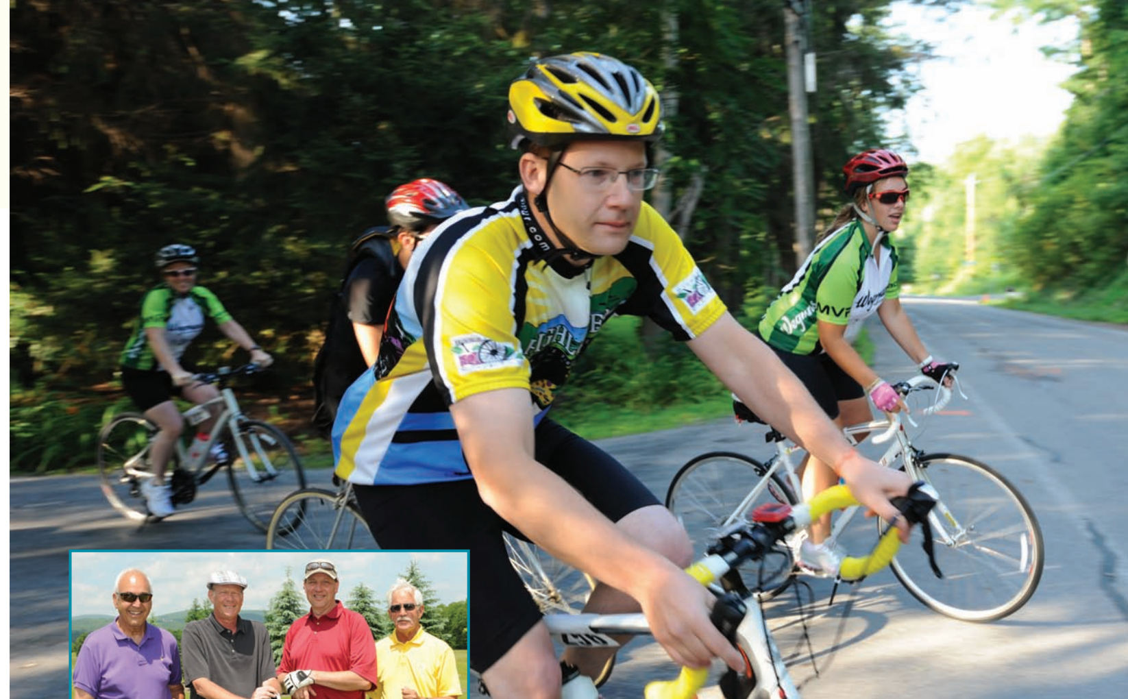
8th Annual Tour de Thompson