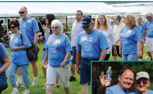
14th Annual Rose Walk