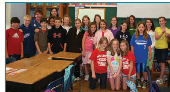
The Canandaigua chapter of the Kiwanis K-Kids