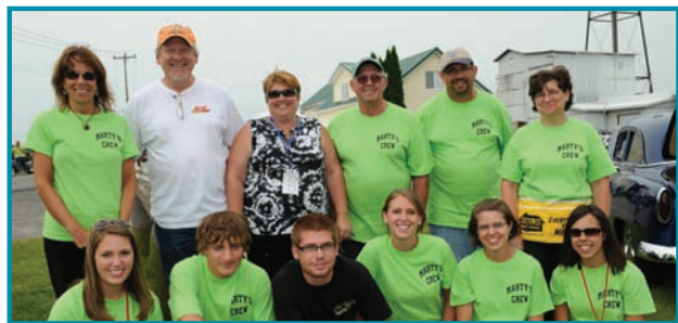
Marty's Chop Shop and Hot Rod Gathering Meet