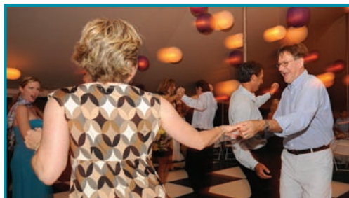
Summer Soiree Wine Auction and Gala