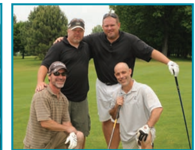
13th Annual Yarger Memorial Golf Scramble