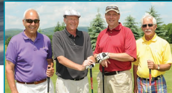
6th Annual Margery Pawluk Golf Tournament