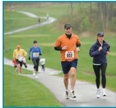
14th Annual Better Life 5K