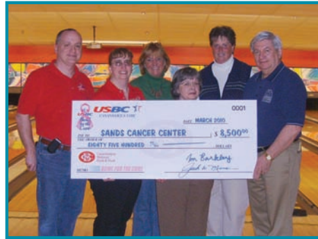
2nd Annual Bowl for the Cure

Each year, dedicated community members and Thompson Health Associates work together to hold a variety of events to benefit many of the programs and services at Thompson. This year, proceeds from special events totaled more than $170,000 to benefit the Sands Cancer Center, Cardiac Rehabilitation, Wellness Services, Rehabilitation Services, Project Excel and more. Thank you to all of those involved in organizing, participating and supporting these events. Your commitment and support do make a difference!